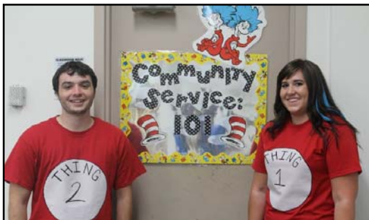
Speakers from an SLC session

Day 3: The morning speaker was truly motivating. He explained the importance of a "5 Person Dream Team" in each of our lives. He made us evaluate the people in our lives to determine if they were really helping us become better people or if they were leading us down empty paths. It was hard to be so honest with our family members and our childhood friends. But the reality is that you need to pick the weeds from the garden, for the flowers to bloom. We really believe that all 4-H members can bloom if given the right surroundings and support. The sessions that day ranged from ways to become an individual (lead your own dance or beat your own drum), tours of the UC Davis Agriculture Center (what an amazing place to study), and permaculture (the study of dirt, its nutrients and other characteristics). That night we had our semi-formal dance. The DJ was super wild, versatile and crazy. We danced the night away.