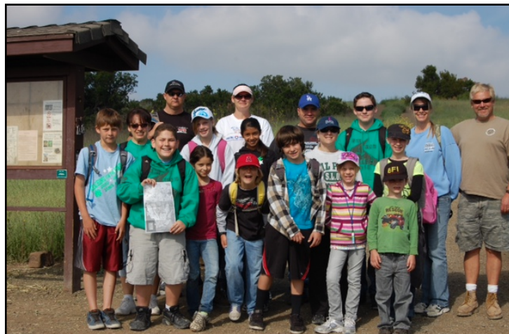
Somis 4-H club on a hiking outing.

This year's calendar is full of exciting activities. Some of the activities that we all look forward to are the fair in August, TOTSOCE in October, and December is Christmas Caroling for the elderly. Somis 4-H meets the 3rd Thursday of every month at 6:30 pm at Somis School.