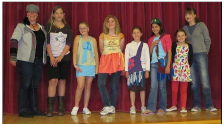
PHOTO: Here are leaders and members of our sewing projects modeling handmade bags and clothing.

Of course, we still have our Cavies and Rabbits, Rabbit Hopping, and Dogs projects to satisfy all of the animal-lovers since we don't have large livestock like most clubs. Although our animals are small, their hearts are just as big! We will be showing some of our pets at the Super Field Day coming in May.