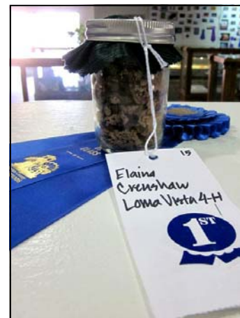
Preserved foods entered by Elaine Crenshaw from Loma Vista 4-H in 2011.

Remember that 4-H entries in the Youth Building include project work as well as photography, literature, educational display/posters, scrap-booking, etc. that reflect the whole, or part of the 4-H experience. Any questions about eligible entries, please review the Entry Guide or contact Gwyn Vanoni at gwvanoni@ucanr.edu .