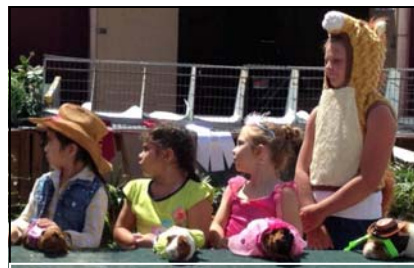
Cavy Costume Contest 2013