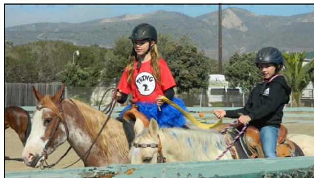
Pictured here are costumed Equine 4-Hers and their horses.