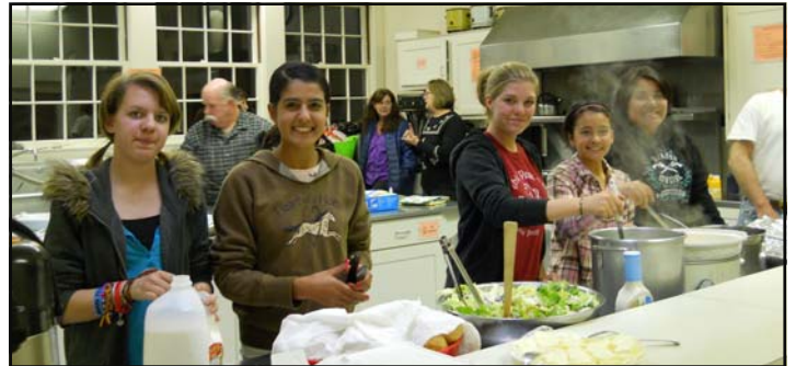
Chief Peak 4-Hers cooking up fun!