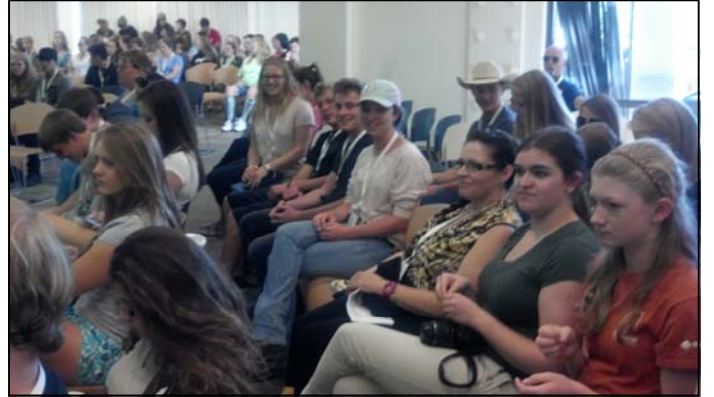
Above: Some of the VC delegates gather by the big trees. Below: Delegates are in session.

We arrived and the 4-H leadership team was very organized in the check-in and program details. We were assigned dorm rooms, provided campus maps, conference agendas and iPads to do on-line registration for the educational offerings. Each day we ate at the campus dining rooms, had an assembly that included an exciting motivational speaker that was geared towards leadership qualities and personal growth, and choices of two educational seminars.