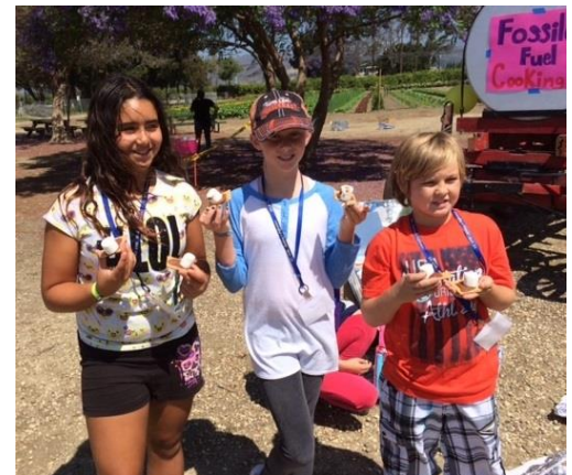
4-H Community Club members at Sustainable You! Summer Camp. Discovering alternative energy with solar oven s'mores.

With help of adult leaders, the busy All Stars planned, organized and delivered the Sustainable You! Summer Camp program to 17 campers ages 9-12. This year 4-H Sustainable You! Summer Camp has expanded to two weeks one 4-H week and one camp for everyone.