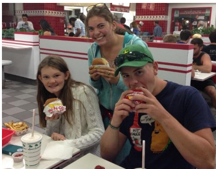
Trying out In-N-Out