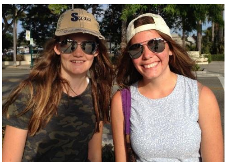
Our future's so bright we gotta wear shades.