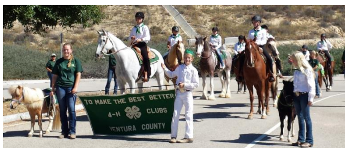
4-H Parade participants