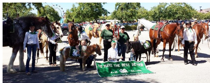
Best equestrian performance trophy