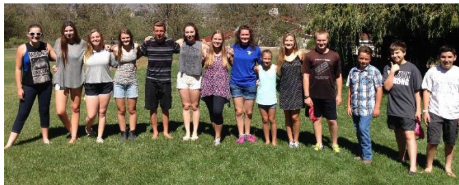
Santa Rosa Valley 4-H Youth Board

Next: November Featured Clubs are Sespe and Somis. Remember, the articles are due the first Monday in October.