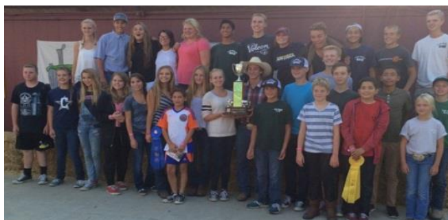
2015 Ventura County Fair