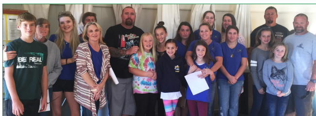
Community Service project. Help of Ojai with Ojai Presbyterian Church. Preparing and delivering food boxes in Ojai Valley.

As 4-H'ers we learn by doing and realize the strength of service in numbers. A hero is made by learning skills that will allow a youth to help, serve, and teach others and develop an appreciation of the value of service. As a 4-H'er we learn that the more we help and serve, the more of an impact we can make in our club, our community, our country and our world.