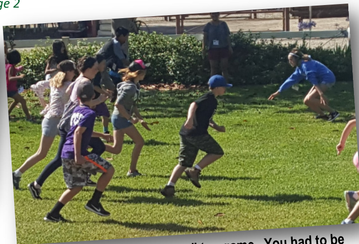
We played a "Predator & Prey" tag game. You had to be fast to keep from becoming the predator's energy source.