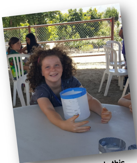
Getting ready to upcycle this old water jug into a planter for