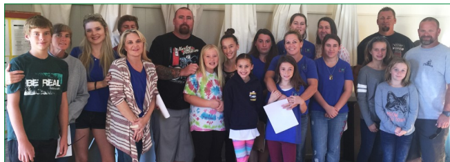
Pictured Above: Community Service project. Help of Ojai with Ojai Presbyterian Church. Preparing and delivering food boxes in Ojai Valley.

Featured Club calendar is at http://ceventura.ucanr.edu/Families - Communities/4-H/Newsletter/