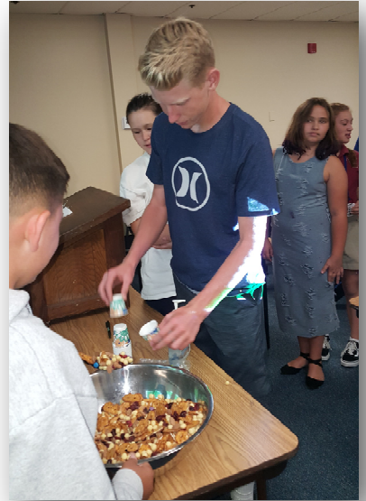
Pictures Top: Officers designed a snack mix using parliamentary procedure. Bottom: Officers acted out a meeting scenario for notetaking practice.

Club Officer Trainings are held annually in late August/early September. If you are going to be a club officer or interested for future years, look for the announcement in the July CloverLines.