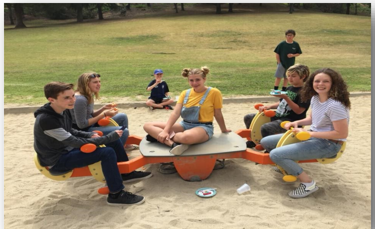
End of Year Party at Arroyo Verde Park