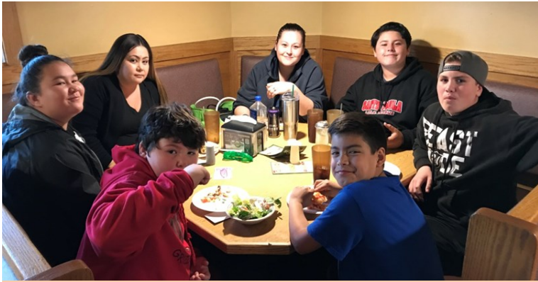
Pizza party for those who collected the most cans for the canned food drive

Graduating seniors are eligible to apply to the Barbara Wilson Memorial Scholarship. This year, they had 7 recipients!