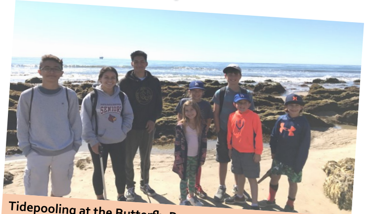
Tidepooling at the Butterfly Preserve in Goleta

Mupu 4-H is very active with many fun projects such as Cooking, Hiking and Swine. Their community service projects include an annual coastal cleanup, collecting and filling backpacks for children of Quilali, Nueva Segovia, Nicaragua, collecting food for Rotary Christmas Gift Baskets, and collecting items for SPARC, a local animal rescue shelter.