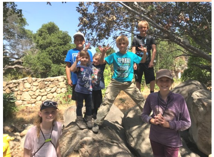
Hiking Sisar Canyon Road in Ojai

Mupu 4-H has an excellent Facebook page where you can find even more pictures of this active club!