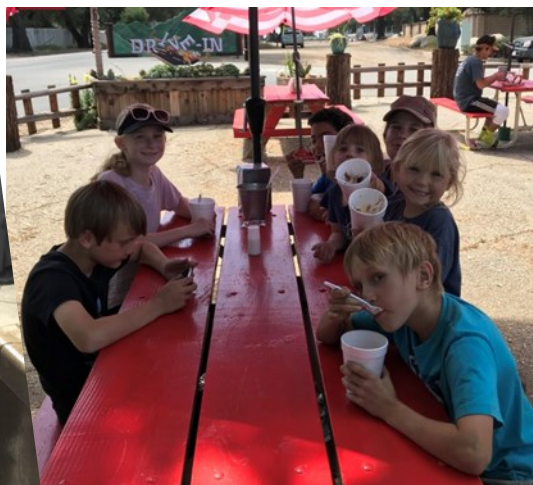
Ice cream after hiking !