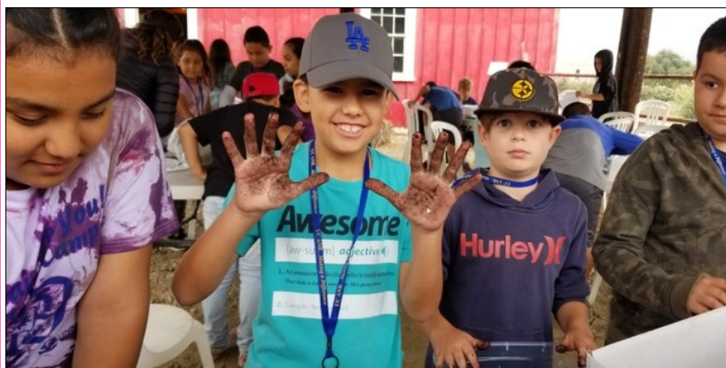
Kids had tons of fun getting dirty at 4-H Sustainable You! Camp