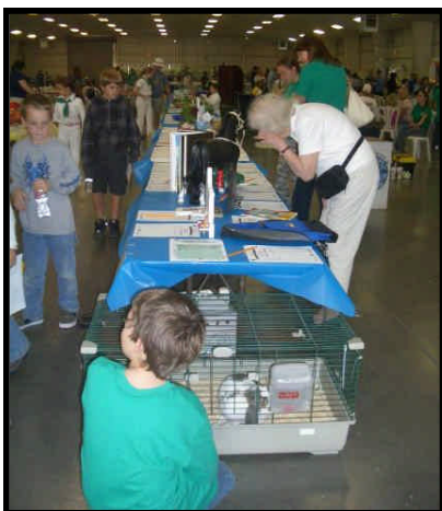
2008 Fur & Feathers Silent Auction Goodies!

Members exhibited their educational posters for ribbons, and event mugs were awarded to the highest scoring posters in each show's age class. Rosettes and ribbons were also awarded to those who competed in each show's Jr. Showmanship, with 1 st place winners from each age class also awarded a Medal.