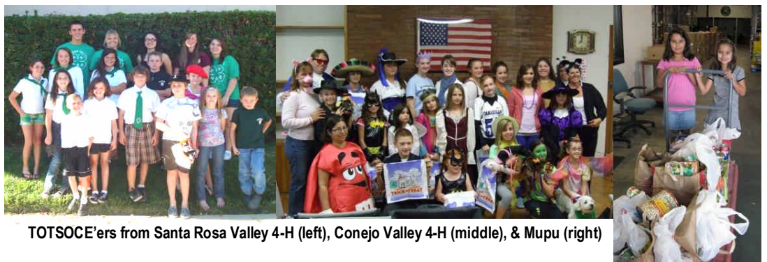
TOTSOC'ers from Santa Rosa Valley 4-H (left), Conejo Valley 4-H (middle), & Mupu (right)