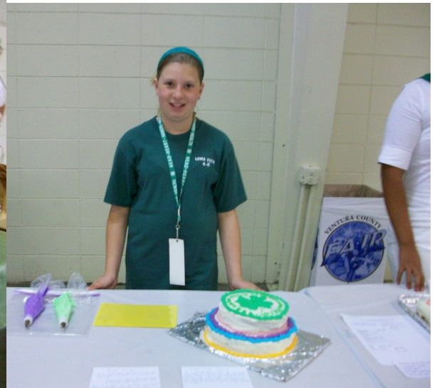
2009 SET Field Day