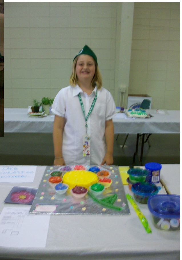
and Food Faire! 😊