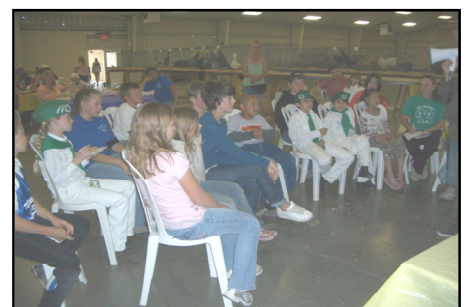
Right: Youth poultry fanciers team up to play "Wheel of Poultry".