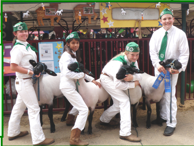
The Somis 4-H Lamb group poses with their animals after market judging at the Ventura County Fair.

The next Featured Club Happenings! will include articles from Tapo Simi 4-H and Tierra Rejada 4-H.