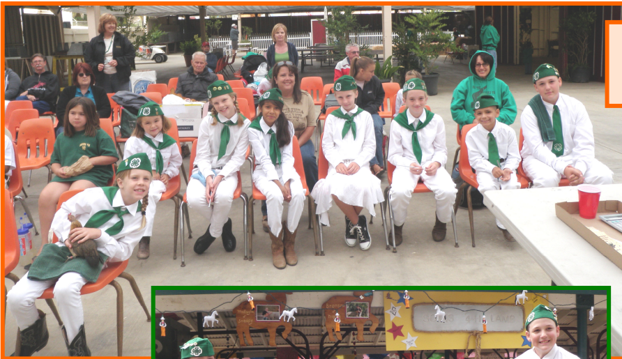
Somis 4H Poultry group members eagerly wait to get called for Showmanship at the Ventura Country Fair.

Lastly, some of the many new projects we have planned for this year are woodworking/arts and crafts, horse knowledge, and overnight camping. This new year we are excited to have quite a few new members. We are looking forward to a great new year!