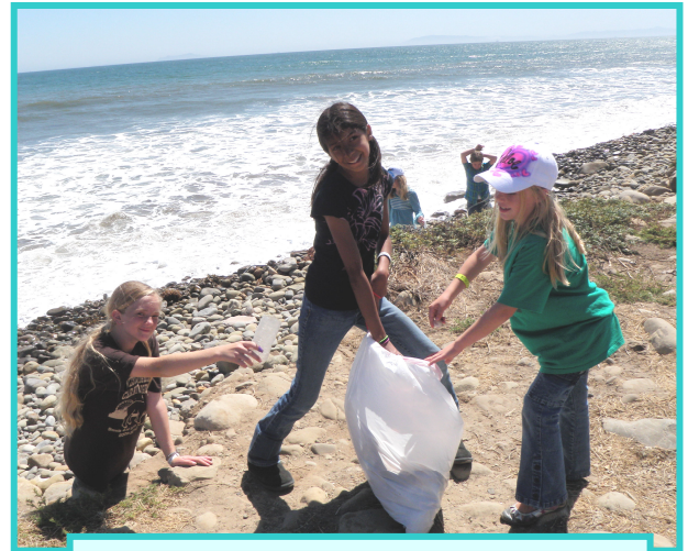
Somis 4H members work hard to clean-up Ventura Beach at the close of the fair.