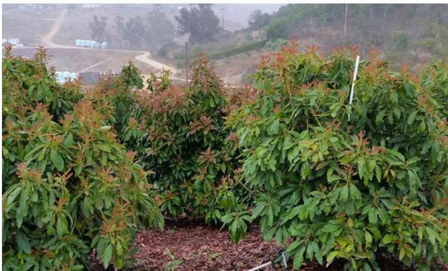
Figure 1. (10' x10' spacing) of 72 trees of Hass and Lamb Hass avocados were planted in Valley Center, CA in August 2012. Also a pollinizer Zutano tree was planted for every 8 Hass trees.

We estimated the costs of water and pruning for the experiment and compared them with the costs of the conventional practices we developed in 2011 (adjusted for inflation). We compared the costs on a cost of a unit of production, i.e. cost per lb. of yield (Table 1).