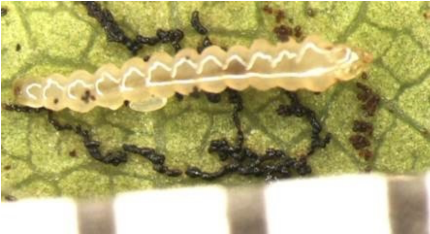
Figure 3. Leaf miner larval stage.