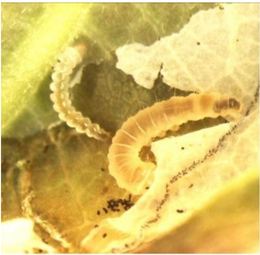
Figure 1. Caloptia larval stages, left and right in photo. Both stages can be found together in the same habitat.