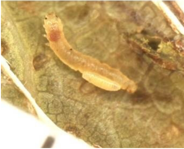
Figure 5. Larval leafroller with the parasite on it.