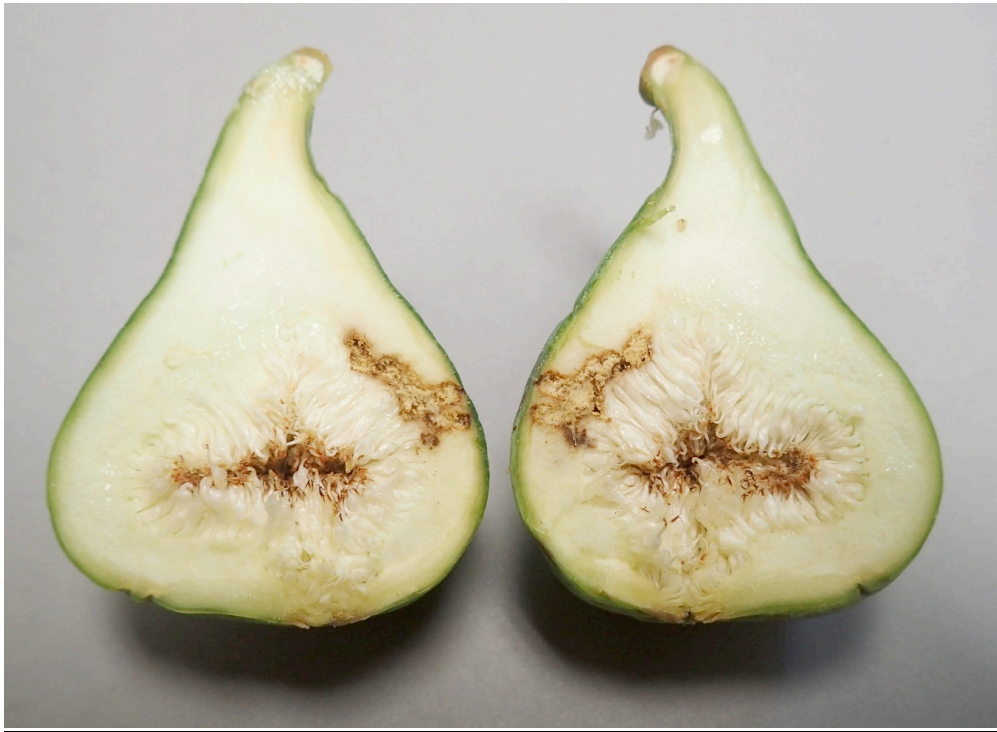
Black Fig Fly Damage