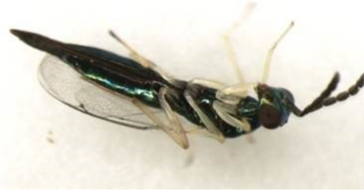
Figure 6. Adult parasitoid.