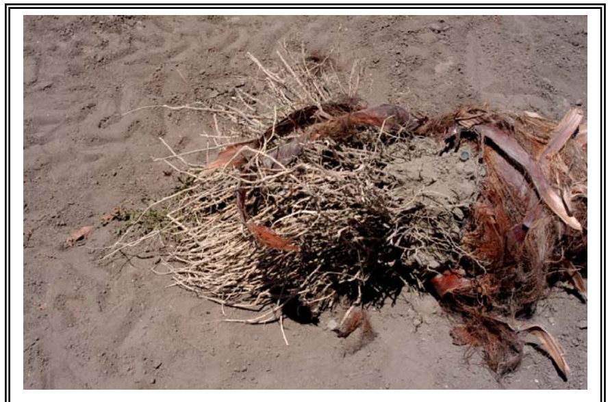
Figure 8. Palm in bare root condition

proper establishment in landscapes. It is important that root balls arrive on the job site intact and in a moist state; otherwise the trees should be rejected. Bare root palms should be highly suspect, as their roots will be subject to the greatest drying stress (Figure 8).