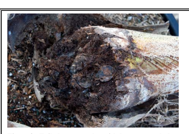
Figure 3. Failed queen palm with banana moth damage