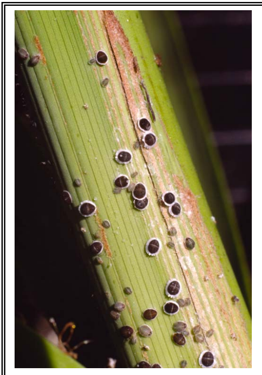
Figure 4. palm aphid