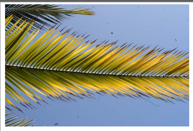
Figure 7. Magnesium deficiency in Senegal Date Palm

Although roots of most landscape palms commonly grown in Southern California will branch or resprout after cutting (Pittenger et al., 2004), cut roots will not resprout if they desiccate. Proper post-harvest handling of large transplanted palms is critical to their