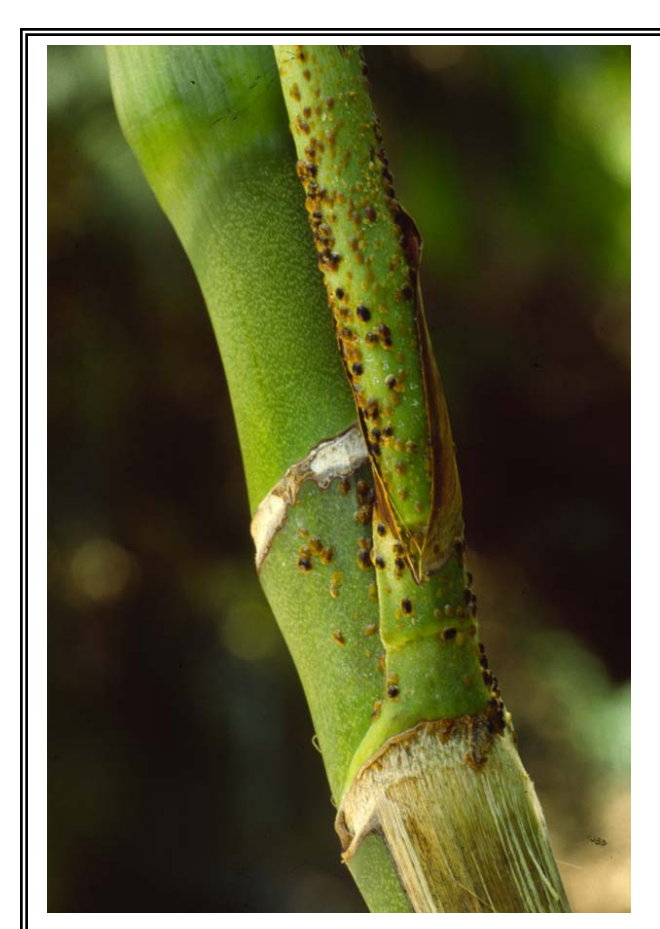
Figure 5. Soft brown scale on palm

The banana moth is a Lepidoptera whose larvae feed in the root initiation zone and lower stem of queen