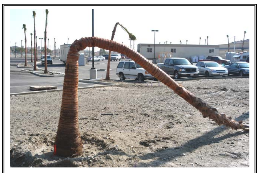
Figure 6. Trunk buckling and failure in Washingtonia spp.

shrinkage and buckling inside the main stem may have caused this failure. In other cases, the palm does not fail but will continue to grow and produce a stem that increases to its normal diameter above the abnormally slender portion. If the trunk grown at the nursery was very narrow, the new larger stem will cause a failure at a later date when its weight exceeds the ability of the skinny stem below to support it. Just as with shade trees, palms should have tapered trunks. Lack of taper or "hour-glassing" along the upper stem may indicate a palm lacking sufficient trunk strength to survive landscape wind conditions.