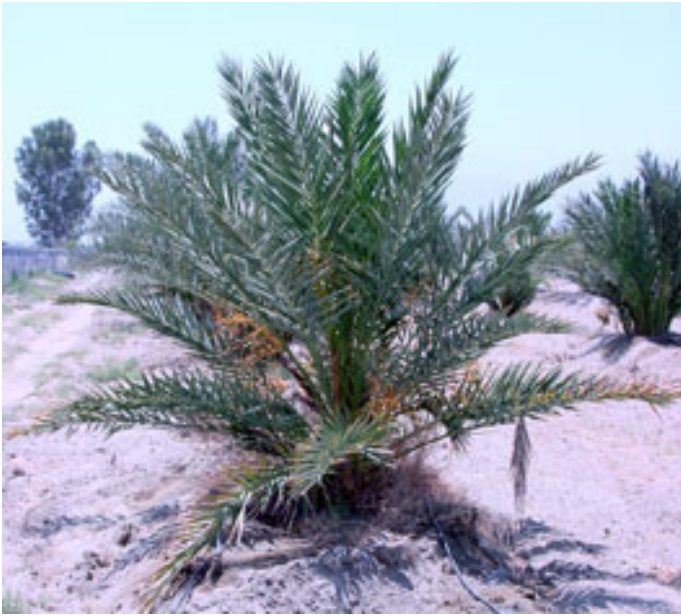
Young 'Medjool' palm grown in the Coachella Valley.