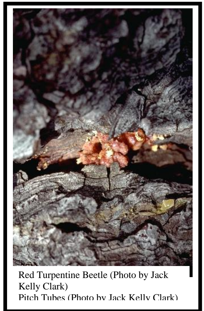
Red Turpentine Beetle

Note: These photos may be clearly seen in full color at our website: http://ceventura.ucdavis.edu